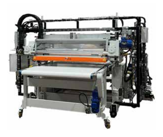
ACU-PUR: Roller Coater