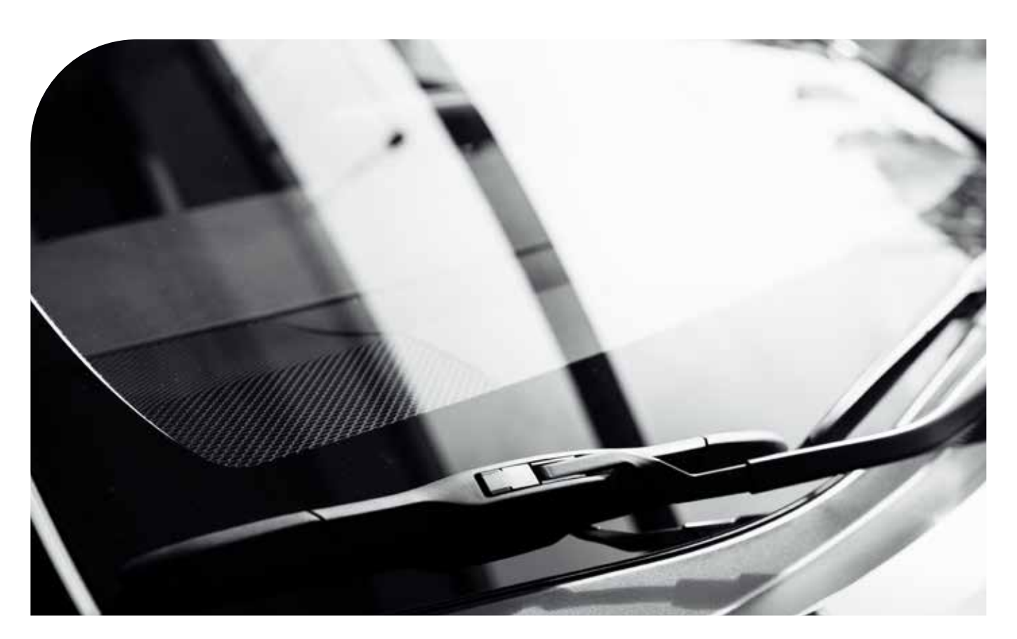
*WB = Water Based