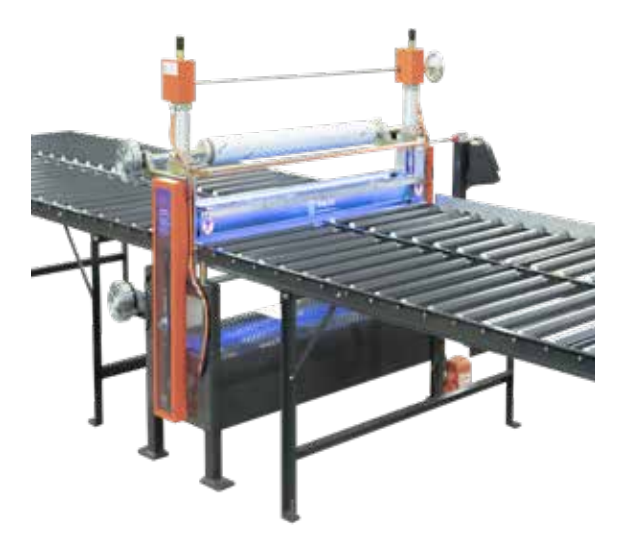
I-Walco: Horizontal Laminator